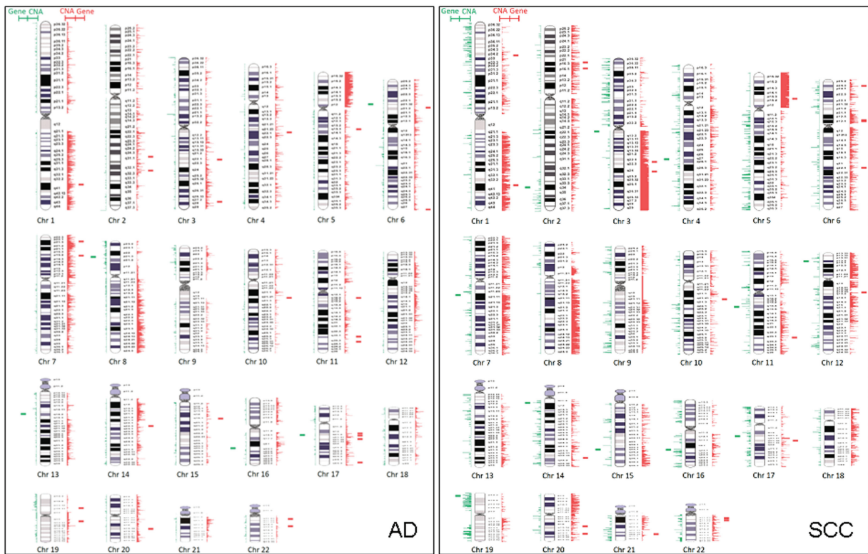
Figure 2. The graphic integration of CNAs with altered expression genes in lung AD and SCC. The red lines represent the amplification regions for CNA and up-regulation genes. The green lines stand for the deletion regions for CNA and down-regulated genes. The lines are relatively corresponding to the physical position along the chromosomes.