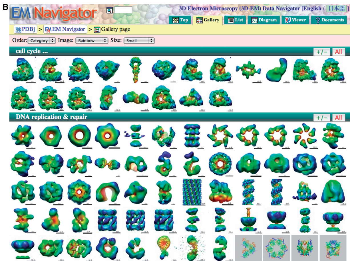
Figure 3. Yorodumi and EM Navigator. (A) Yorodumi displaying an EMDB-PDB hybrid data, EMDB-5168 and PDB 3MFP (helical assembly) (40). (B) EM Navigator gallery page.