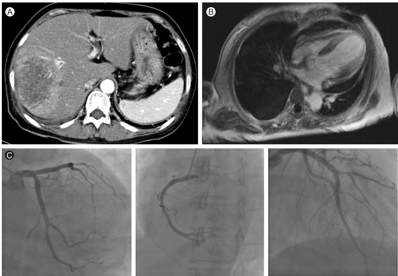
Figure 1. (A) Abdominal computed tomography scan showing a large (9 × 8 cm) clustered cystic looking mass in segment VIII of the liver indicating an abscess. (B) Four-chamber view cardiac magnetic resonance imaging (T1WI). Note the absence of delayed hyperenhancement in the affected myocardium. (C) Normal coronary angiographic findings.

Soon after, the patient's systolic blood pressure dropped to 70 mmHg. Hypotension persisted even after appropriate fluid resuscitation. The patient was transferred to the medical intensive care unit (ICU) and given vasopressors,