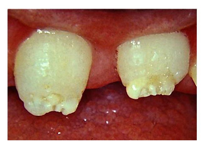
Figure 2 Enamel hypoplasia of maxillary central incisors (Hutchinson's teeth).

A 7-year-old female presented with her mother to the clinic with the complaints of poor dental esthetics. The patient was diagnosed with late congenital syphilis (2 years after