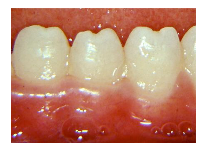
Figure 3 The semilunar notch on the incisal edge of mandibular incisors (Hutchinson's teeth).

birth). She was non-reactive for HIV. The patient was on regimen of penicillin treatment from late congenital syphilis and corticoid therapy. Hutchinson's triad was detected by the presence of interstitial keratitis (figure 1), with corneal scarring and initial presentation of bilateral blindness; deafness from auditory nerve disease and dental defects (figures 2 and 3).