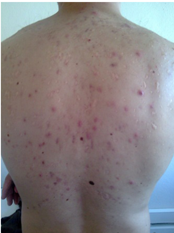
Figure 1 Scattered acne skin lesions in the dorsal trunk.

As its underlying aetiopathogenesis is still poorly understood, the treatment of SAPHO syndrome remains