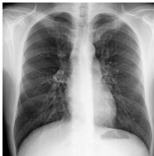
Figure 2 Chest radiography showing bilaterally severe destruction of the sternoclavicular joint.