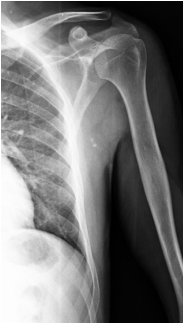
Figure 4 Left femur plain radiography showing osteosclerosis and hypertrophic osteitis.

thoracic region, vertebrae or sacroiliac joints), with or without characteristic skin lesions;