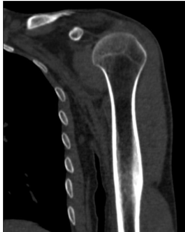
Figure 5 CT scan of the left arm showing typical synovitis, acne, pustulosis, hyperostosis and osteitis lesions of hypertrophic osteitis.

In acne, the presence and activity of the anaerobic organism Propionibacterium acnes , has been advocated as a triggering factor and has been related to more severe skin lesions. 10