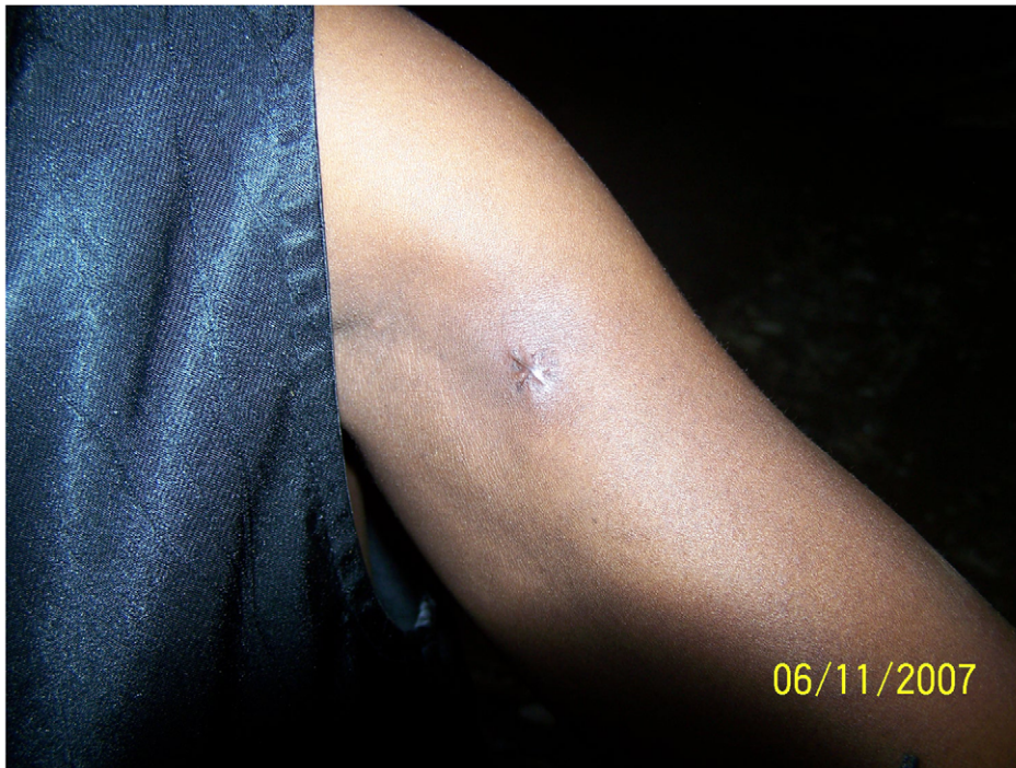
Figure 6. Healed lesion without complication after antibiotherapy alone without surgery.