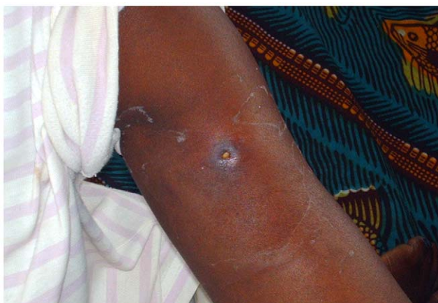
Figure 5. Single ulcerative lesion <5 cm diameter (confirmed by IS2404-PCR). doi:10.1371/journal.pntd.0001402.g005

The capacity strengthening of medical staff on the surgical management of BU patients through local and international training, the introduction of specific antibiotherapy (rifampicin