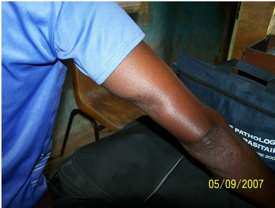
Figure 4. Healing without complications after antibiotherapy combined with surgery. doi:10.1371/journal.pntd.0001402.g004

attributable to the control project itself, it is usually considered sufficient by policy makers to conclude to a beneficial effect [15]. The threefold increase in the number of BU cases admitted annually can to a large extent be explained by the active case-finding and the reduction of the financial barrier, as patient care was free after 2004, but is probably also due to the improvement of patient management and the quality of clinical results. While both aspects are likely partially involved in the observed results, the observational study design will not allow us to distinguish between the two.