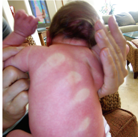
(b) 2 weeks—Father's Hand Print