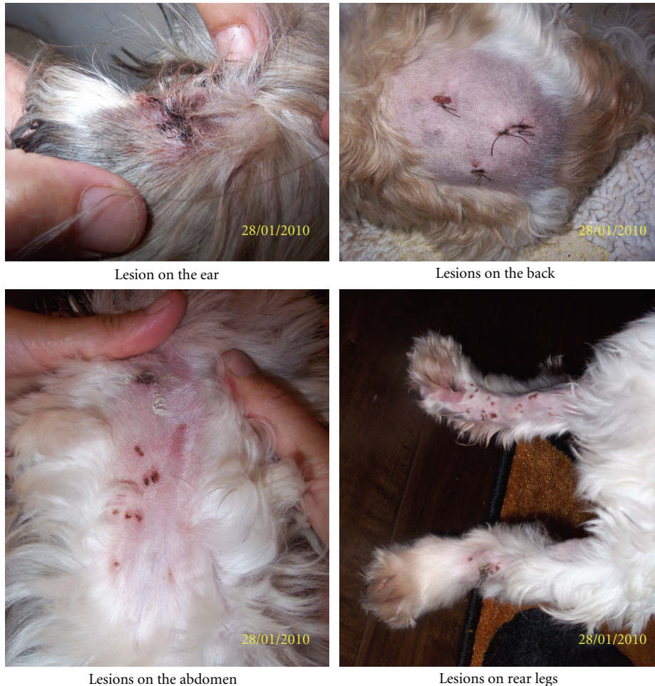
FIGURE 2: This figure demonstrates the sites of the subcutaneous and lipoma tumors that were removed from the pet dog. The Veterinarian stated that the presence of 72 such lesions on an animal is a very rare observation.

with elevated confusion, fatigue, and tension. The mother also had 17 abnormalities, identical to those of the husband (data not repeated). The neurological scores for the daughter were within normal ranges. However, the physical exam revealed abnormal past pointing without dysmetria (finger to nose) and fine resting tremors at 3–4 per second increasing to 10 by intention with amplitude increased. The son (age 5) did not have any detectable neurological deficits. However, the neurological testing is not designed for 5 year olds.