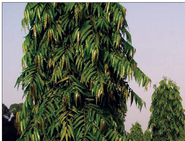
Figure 3: The whole tree of P. longifolia