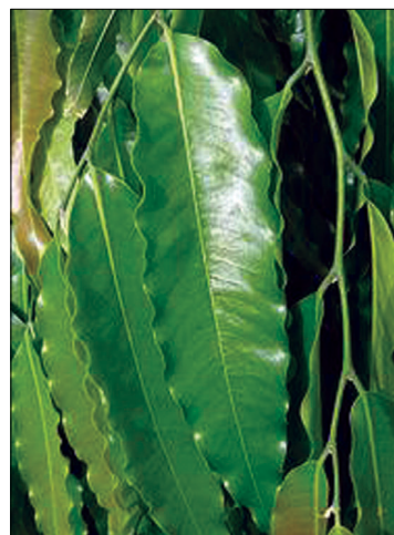
Figure 1: Leaves of P. longifolia

The plant grows throughout the tropical and subtropical parts of India up to an altitude of 1500 m. A tall, evergreen, handsome, pyramid-like, columnar, tree: main stem straight, undivided, growing up to 12 m or more. Branches slender, short, about 1-2 m long, glabrous, and pendulous. Leaves alternate, exstipulate, distichous, mildly aromatic, 7.5-23 by 1.5-3.8 cm, shining, glabrous, narrowly lanceolate, tapering to a fine acuminate apex, margin markedly undulate, pinnately veined, leathery or subcoriaceous, shortly petiolate; petiole about 6 mm long. Flowers arise from branches below the leaves, nonfragrant, 2.5-3.5 cm across, yellowish to green, in fascicles or shortly pendunculate umbels; petals 6, 2 seriate, flat, from a broad base, lanceolate, long acuminate, spreading; and sepals 3, broad, short, triangular, the tips reflexed. Stamens many, cuneate; connective truncately dilated beyond the cells. Ovaries indefinite; ovules 1-2; style oblong. Ripe fruits ovoid, 1.8-2 cm long, numerous, stalked, glabrous, 1 seeded; stalk 1.3 cm long, short, glabrous. Seeds smooth, shining. Flowering and fruiting: February-June. [25,26]