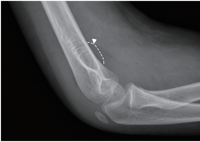
Fig. 1. Lateral view of the right elbow shows soft tissue swelling with a positive fat pad sign (arrow head).