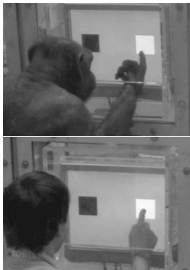
Fig. 2. Experimental setup. Chimpanzee Ai ( Upper ) and a human participant ( Lower ) performing the task.

Our results indicate that chimpanzees spontaneously associate high-pitched sounds with luminance (white) and low-pitched sounds with darkness (black), as do humans. In previous studies, teaching chimpanzees tasks involving auditory stimuli was found to be extremely difficult (19–21). For example, even after intensive training, only one out of six chimpanzees learned to press