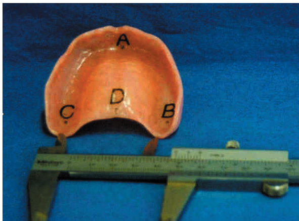
Figure 2. Linear distances between marked reference points A, B, C and D measured with a metal gauge.

To determine the adaptation or the interfacial gap between acrylic resin bases and the stone casts after water storage, the specimens were sagittally sectioned with a precision rotary microtome (Slee Cut, 6062, NIC Medikal, Izmir, Turkey) in an anteroposterior direction along the imaginary line passing between reference points A and D (Figure 2 and 3). A second frontal cross section - perpendicular to the sagittal section - was performed along a path passing between right and left first molar regions (Figure 2 and 3). To measure the interfacial distance between the cast surface and the inner surface of acrylic resin bases, seven reference points were marked along the resin base/stone cast interface in sagittal sections and five reference points were marked at frontal cross sections (Figure 3). Measurements were performed at these reference points as previously described, 24 hours after the polymerization process. A second measurement was performed after the storage of the specimens in water for 30 days