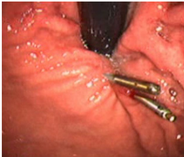
Figure 4 Aspect of the subcardial region after application of the endoclips.

to originate from the muscularis propria in three patients and from the muscularis mucosa in one.