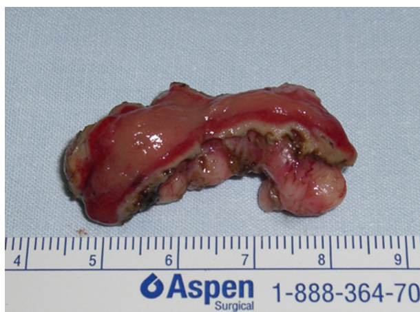
Figure 5 Operative specimen after endoscopic enucleation. The overlying mucosa was resected en bloc.

No complications were observed except for some degree of air filtration causing symptomatic pneumoperitoneum