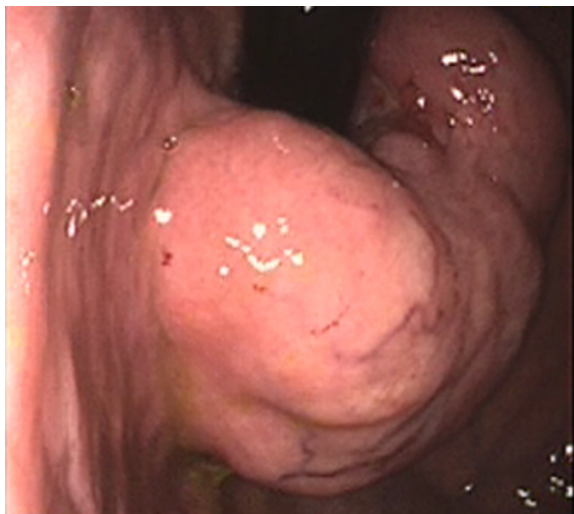
Figure 1 Retroflexed endoscopic view of a giant leiomyoma of the gastroesophageal junction.

dyspepsia in two patients and dysphagia to solid food in the other two. On imaging, the tumor appeared as a C-shaped lesion originating from the posterior aspect of the gastroesophageal junction and involving between 50% and 75% of the circumference of the cardia. On endoscopic ultrasound examination, the tumor appeared