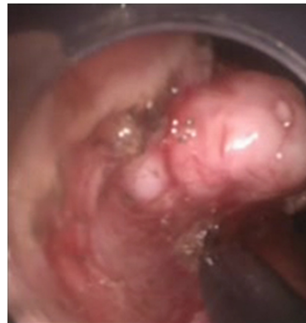
Figure 2 Submucosal dissection of the leiomyoma started along the lower border of the lesion and was facilitated by the endoscopic cap.

There were three females and one male with a mean age of 44 years (range 36–58 years). None of them had previous gastric surgery or significant comorbidity. The mean duration of symptoms was 10 months (range 4–18 months). The predominant symptom was reflux-like