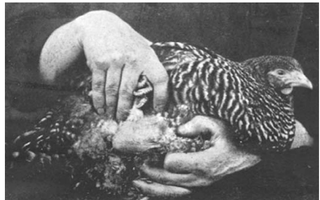
Figure 2. The original Plymouth Barred Rock fowl bearing the tumor presented to Rous and held by somewhat arthritic hands. Reproduced from Rous, 1910.

It is interesting to return to the step by step progress of Rous's research. Rous (1910) became interested in the transplantability of tumors when a woman came to the Rockefeller Institute with a Plymouth Barred Rock hen with a large tumor (Fig. 2). At that time, highly inbred mice were not yet available, although Loeb (1901) had started to experiment on tumor transplantation with a sarcoma in a partially inbred line of white rats. The canine transmissible venereal sarcoma (Novinski, 1876) was the only tumor to be naturally