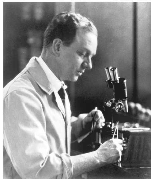
Figure 1. Peyton Rous in 1923. Van Epps, 2005. J. Exp. Med. http://dx.doi.org/10.1084/jem.2013fta

Rous's most famous discovery was finding that a sarcoma in the domestic fowl was transmissible to other fowl by a tumor extract that he had passed through a filter too fine to contain chicken cells or bacteria. In other words, the tumor-inducing agent was a "virus," which later became known as RSV. The importance of this finding was twofold. First, it demonstrated clearly for the first time that a malignant tumor could be induced by infection. Many other examples of tumor-inducing viruses in rabbits,