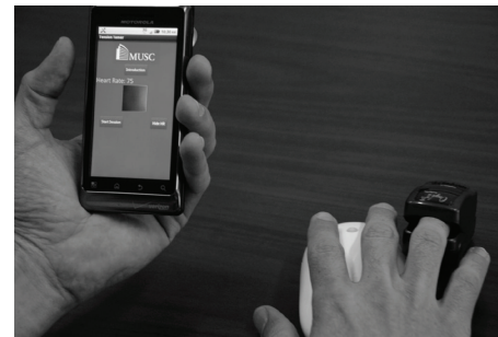
FIGURE 2: Placement of Droid and Nonin devices during data acquisition.

a BioZ thoracic bioimpedance monitor (SonoSite, Bothell, WA) placed 5 cm apart at the level of the xiphoid notch in the midaxillary line and at the angle of the jaw on each side of the neck. The sensors formed four ECG vectors. The BioZ detects these ECG vectors, and the RR intervals are converted into beat-to-beat HRs including a record of the real time of each beat. To match readings provided by the Nonin 9560, the BioZ ECG was set to measure 4 beat rolling averages. Subjects were then seated at a desk, at a comfortable distance (“15” to “20”) from a “15” diagonal laptop computer screen, and the cell phone was held in the left hand with the index finger covering the lens and LED (see Figure 1). All subjects were right handed.