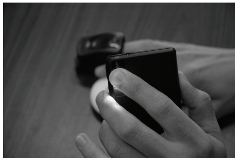
FIGURE 1: Placement of index finger with Droid device.

F: female; M: male; NHW: non-Hispanic White; NHAA: non-Hispanic African American; HW: hispanic White; EH: essential hypertension; HC: hypercholesterolemia.