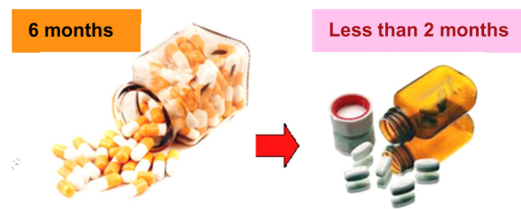
Figure 2 TB drug regimen goal. Abbreviation: TB, tuberculosis.

Duration of the curative regimen must be shortened to less than 2 months or, ideally, to days (Figure 2). It should be