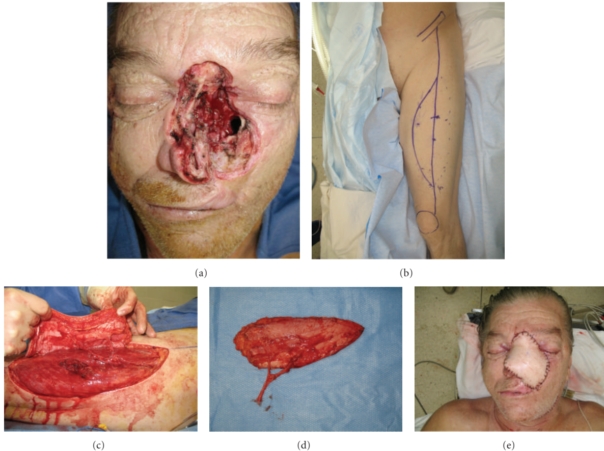
FIGURE 3: A 61-year-old male with a poorly controlled left facial basal cell carcinoma. (a) Maxillectomy defect; (b), (c), (d) ALT-free flap with long vascular pedicle; (e) inset of ALT-free flap.