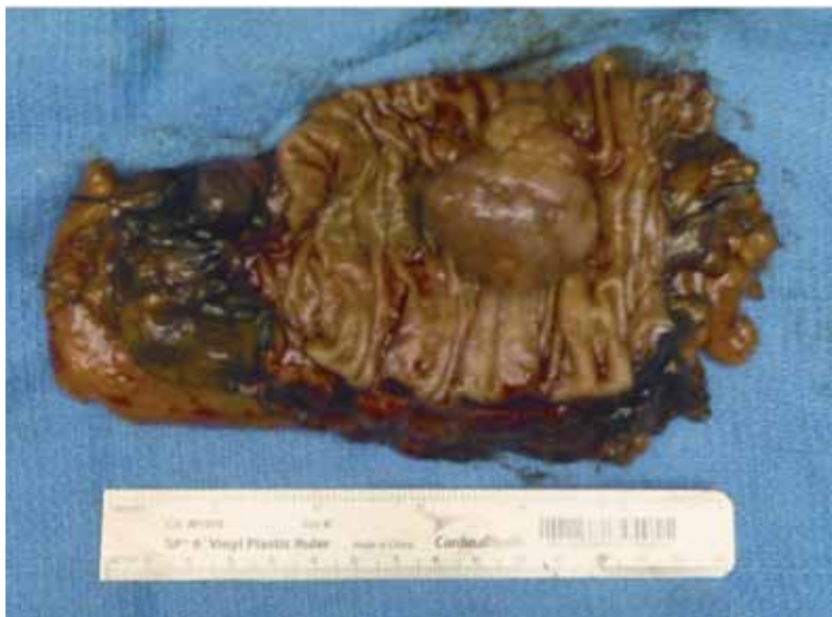
Figure 2. Gross surgical pathology at the time of resection revealed a large pedunculated mass.

seventh report of a transverse colonic lipoma published in the literature (Table 1).