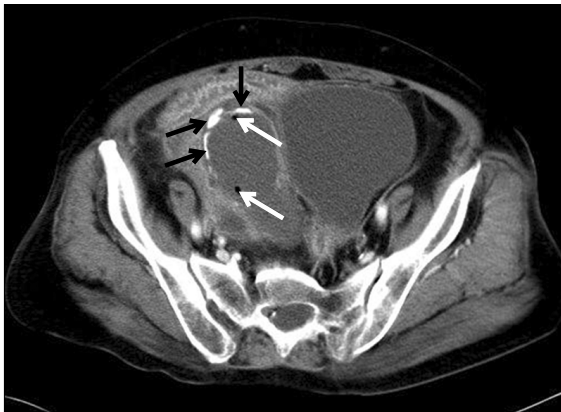
Fig. 1. Enhanced abdominal computed tomography (CT) findings. An abdominal CT scan in our 78-year-old female patient with right lower quadrant pain revealed a well-encapsulated cystic mass with intraluminal gas (white arrows) and calcifications (black arrows) in expected region of the appendix.

operation. The pain was located over the right lower quadrant of the abdomen. She had no change in bowel habits, bloody stools, or tenesmus. On physical examination, she was febrile, and had a pulse rate of 98 beats/min and a blood pressure 140/80 mmHg. A mass was palpated over the right lower quadrant with direct and rebound tenderness. The psoas sign was positive. Decreased bowel sounds were noted during auscultation. Laboratory findings were almost normal, except for the white blood cell count and hemoglobin (red blood cell count 303 \times 10^4/\text{mm}^3 , hemoglobin 9.9 g/dL, hematocrit 28.6%, platelets 37.5 \times 10^4/\text{mm}^3 , and white blood cell count 13,200/\text{mm}^3 ). Serum analysis returned the following; total protein 7.4 g/dL, as-