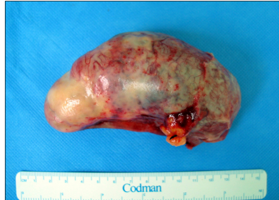
Fig. 3. Photograph of the pathologic specimen. Grossly, the appendix was approximately 10.5 cm long and 4.7 cm in diameter.