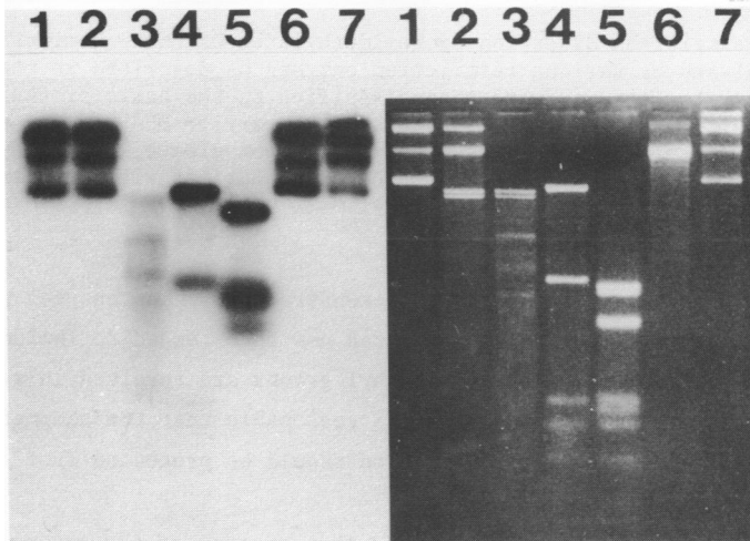
Fig. 1. Restriction digestion of hemimethylated \phi X DNA. Hemimethylated [ ^{32} P]-DNA and natural \phi X RF were digested by various restriction enzymes and analyzed by analytical agarose gel electrophoresis as described in Materials and Methods. The digestion pattern of the \phi X RF was monitored by ethidium bromide staining (right side) and is compared to the cleavage of the labelled hemimethylated DNA as analyzed by autoradiography (left side). The various lanes include undigested DNA (1) and DNAs cleaved by Apy I (2), BstN I (3), Taq I (4), Mbo II (5), Sac II (6) and EcoR II (7). \phi X RF is not cleaved by EcoR II due to the in vivo methylation of this restriction modification site. Apy I gave only partial digestion of \phi X RF, in this experiment. However, in other experiments with 1000 fold excess of Apy I enzyme the same results were obtained with hemimethylated DNA as seen here (lane 2, left side).

It should be noted that in cases where 5-methylcytosine is involved in restriction specificity, methylation in one strand was sufficient to inhibit