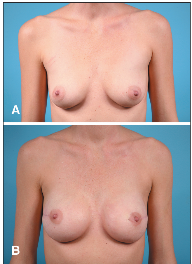
Figure 2 Bilateral lateral incisions. Preoperative (A) and two-month postoperative (B) photographs of a 33-year-old woman with BRAC-1 mutations and a strong family history of breast cancer who underwent bilateral expander/implant breast reconstruction following nipple-sparing mastectomy using lateral incisions

All mastectomies were performed by one of two breast oncologists (NH or SK). The technique varied only by choice of incision location: periareolar, lateral or inframammary. The periareolar incision involved