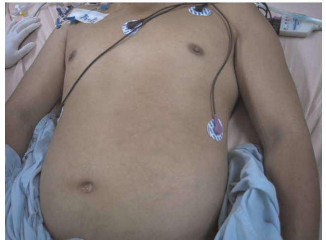
FIGURE 2. Fine, non-itching, red-colored eruptions developed over the abdomen on the second hospitalization day.

drug alone. His recovery was uneventful, and the microscopic agglutination test confirmed the diagnosis of leptospirosis.