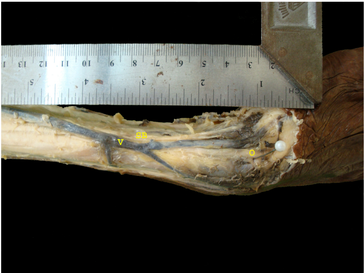
Figure 1 A dissected specimen showing superficial branch of the radial nerve (SB), Cephalic vein (V), And the reference point-Radial styloid (O).

measured along a plane perpendicular to the axis of the forearm, at the level of the Lister's tubercle (Figure 3). V1 was the point where the cephalic vein crossed the superficial radial nerve. Additional intersections if observed were likewise named as V2, V3 etc. OV1 and OV2 distances were measured along the axis of the forearm between the styloid process of the radius and the V1 or V2 points, respectively. All distances were measured with the aid of a caliper.