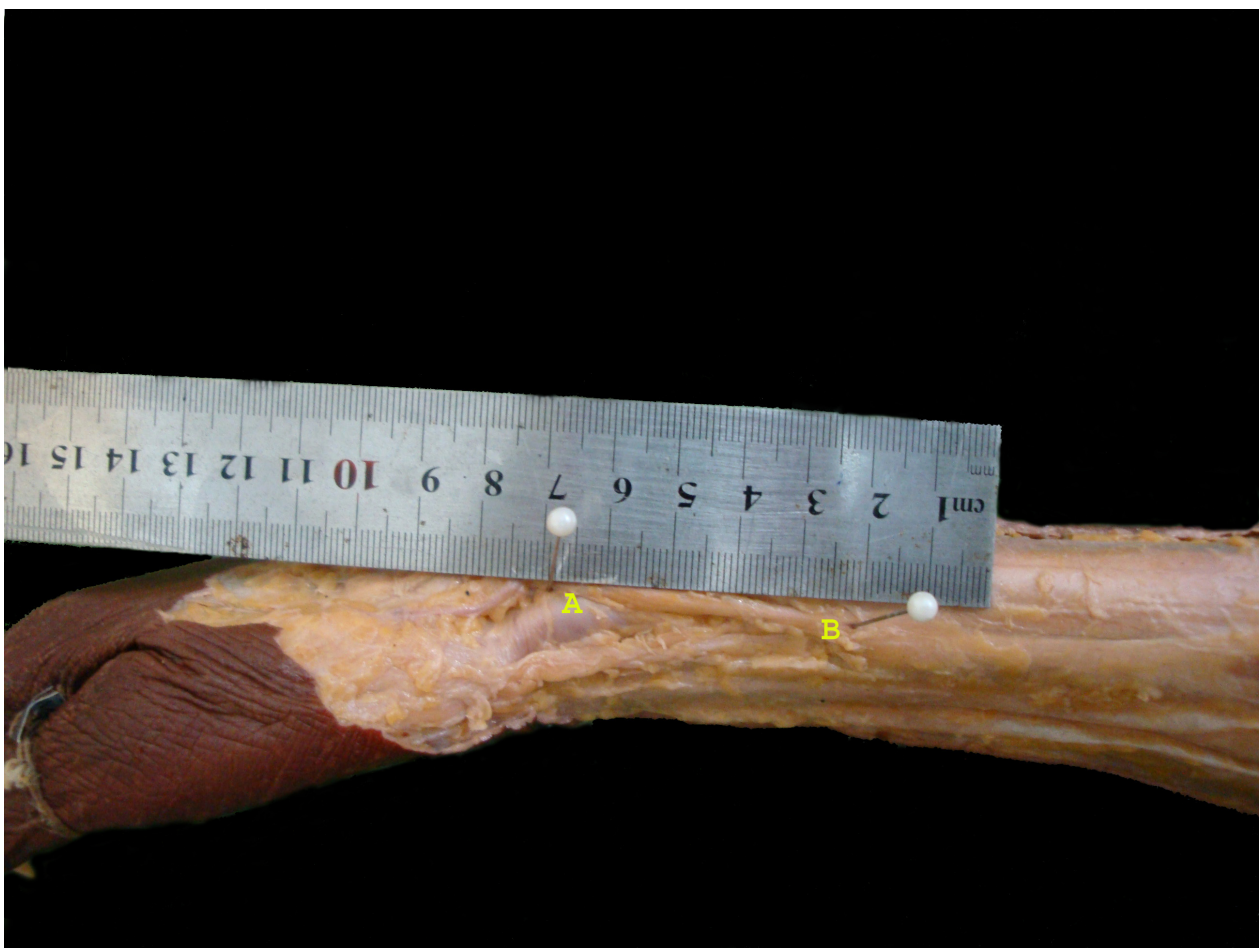
Figure 2 A dissected specimen showing the point of emergence of the nerve (B), with the reference point-Radial styloid (A).

radius in all 25 specimens studied. In the study of Abrams et al [7] it reached 11.6 cm and averaged 9.0 cm. Auerbach et al [9] reported similar distances, with an average of 8.6 cm (range, 6.1-11.8 cm). Robson et al [8] reported that the SBRN emerged from under brachioradialis by a mean of 8.31 cm proximal to the radial styloid. Our results are consistent with these studies as the differences were not statistically significant (Table 1)