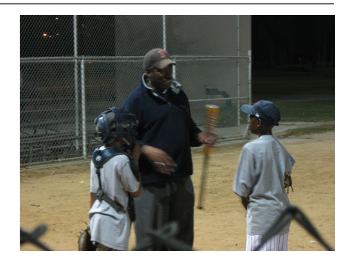
Figure 3. Photograph and quote depicting social support from community members. "You don't really see black men in a neighborhood helping out. But (these coaches) are giving back to the community. They helped me to get to where I'm at now. Without them I really couldn't do nothing."

All twelve participants described ways in which they helped the younger generation: "My new team that I'm coaching. It's a lot of boys, a lot of good talent, and a lot of lost souls. They don't