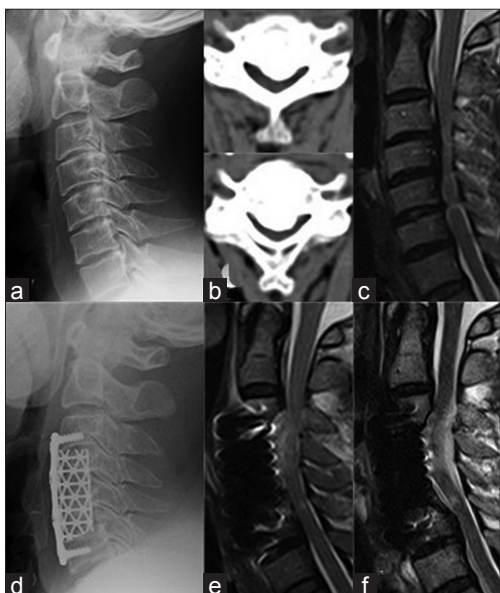
Figure 2A: A 45-year-old man, who also suffered from continuous cervical OPLL of multiple levels. (a–c) Preoperative lateral X-ray, cervical plain CT and MRI demonstrated significant compression of the spinal cord. The patient underwent subtotal C4–C6 corpectomy and decompression, and a titanium mesh cage and plate combined with bone graft was used for the fixation. (d) Postoperative lateral X-ray showing satisfactory reduction with a titanium mesh cage and plate, (e, f) but the degeneration of the spinal cord can be observed at the day after surgery and 24 months postoperative, respectively