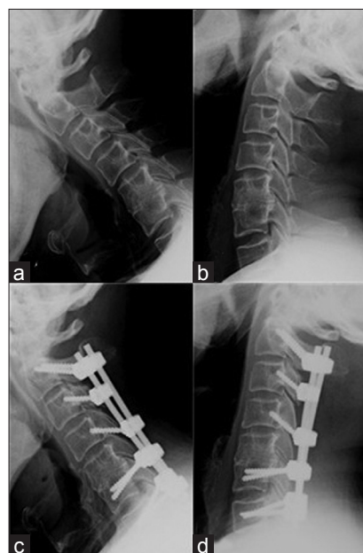
Figure 1B: Followup of same patient. His preoperative JOA score was 8, the postoperative JOA score was 15, and his IR was 78%. (a–d) His cervical ROM in the sagittal plane decreased from 50° preoperative to 40° postoperative. At the last follow-up, no progression of the OPLL or related complications was observed. The outcome was satisfactory

OPLL begins with a pathological extracellular hyperplasia