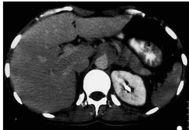
Figure 1: Abdominal CT demonstrating a large, heterogenous para-aortic mass (5×2 cm) with a ttenuation score of 35 HU between the celiac and superior mesenteric artery

Two aspects render our case unusual 1) the coexistence of pheochromocytoma with renal artery stenosis 2) to our sincere belief ours is the first such report from India.