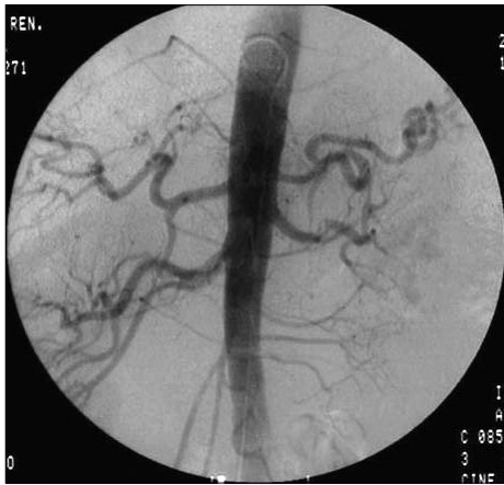
Figure 2: Renal arteriography showed stenosis (> 70%) of the left renal artery