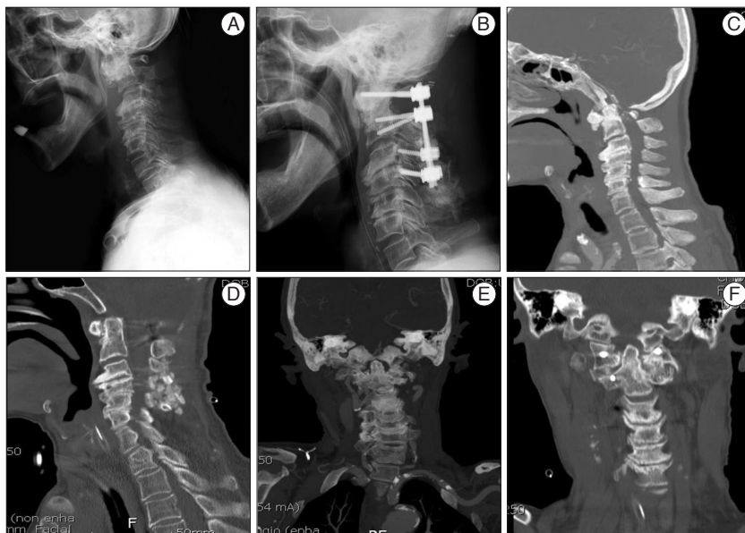
Fig. 2. Case 2 image findings. A : Preoperative X-ray showing severe kyphosis with degenerative spondylotic change and increased ADI about 9 mm and BI. B : Postoperative X-ray showing correction of cervical kyphosis and reduction of BI as well as C1-4 fixation. C-F : Compared with preoperative CT, postoperative CT showing decompressed craniovertebral junction and distracted joint space in which in which autograft iliac bone spacer (arrow) have been placed. ADI : atlanto-dental interval, BI : basilar invagination, CT : computed tomography.

ments, vertebral artery, and spinal cord, factors that should be considered in the surgical decision making are numerous and complex 13 . Among them, for AAI and BI cases with the symptom of the protruded odontoid tip compressing the spinal cord or the brain stem in the ventral side, the choice treatment was to perform first anterior transoral odontoidectomy and occipitocervical fusion or cervical traction and thus performing the release of the ligaments around the odontoid process, and subsequently to perform posterior fusion 4,12,17,18 .