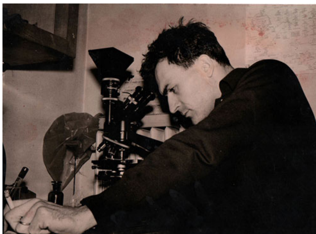
Fig. 1 Ferruccio Ritossa looking at chromosomal puffs in his laboratory in the early 1960s