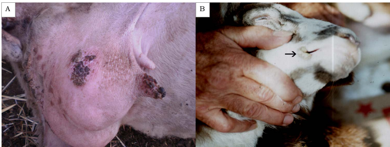
Figure 2 Representative lesions of orf in the teats of ewes and around the lips and the nostrils of their lambs. (a) Orf scabs in the body of a teat and the skin of the udder of a ewe. (b) Orf lesions in the commissures of the lips of a lamb.

The 'GRE-2 teat 2004' Orf virus strain (isolated from cases of orf in the teats of ewes and around the lips and the nostrils of their lambs) clustered together with the following strains: Hoping and Taiping from Taiwan, Cro-Goat 11727/10 from Croatia, Hub/2009 and ORFV/