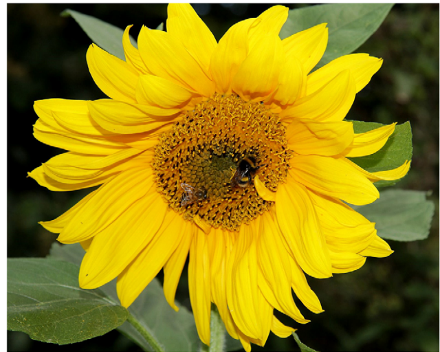
Figure 3. A bumblebee ( Bombus terrestris ) and a honeybee ( Apis mellifera ) foraging from the same sunflower inflorescence ( Helianthus annuus ). doi:10.1371/journal.pone.0031444.g003

In addition to this, we also demonstrated that heterospecific cues, once they have been learnt as predictors of reward on one flower species, can facilitate the sampling of new flower species.