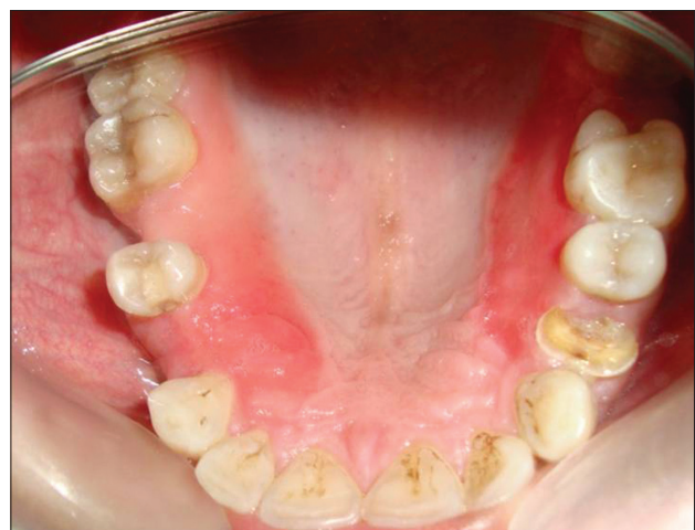
Figure 1: Intraoral preoperative view