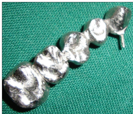
Figure 7: Matrix and patrix assembled together