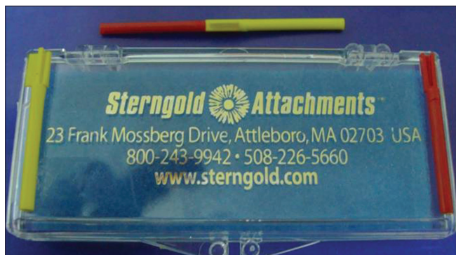
Figure 2: Semi-precision attachment – plastic dovetail

Shillingberg [4] suggested placing the connector at the distal aspect of pier abutment. Since the long axis of the posterior teeth usually leans slightly in a mesial direction, vertically applied occlusal forces produce further movement in this direction. This would nullify the fulcrum effect and the patrix/male of the attachment would be seated firmly in place when pressure is applied distally to the pier. This position has been supported by finite element analysis study [5] done by Oruc et