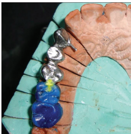
Figure 6: Wax pattern of patrix