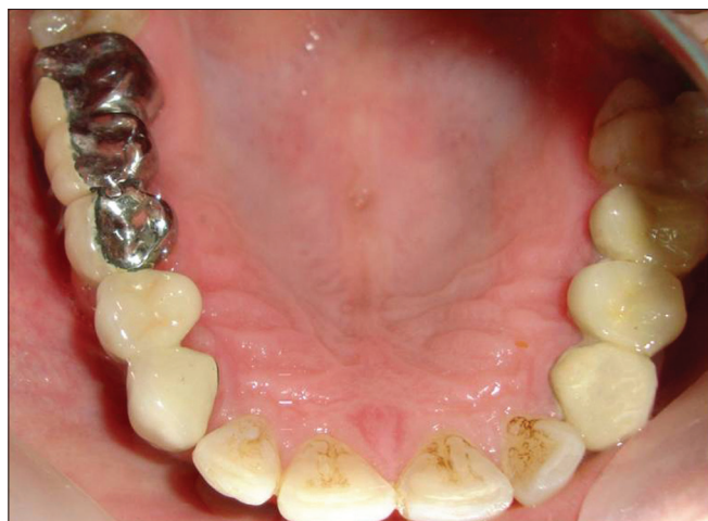
Figure 10: Postoperative occlusal view

al. In this case, we have placed it on distal aspect of the pier.