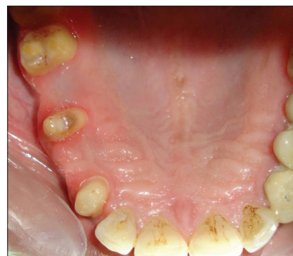
Figure 3: Tooth preparation