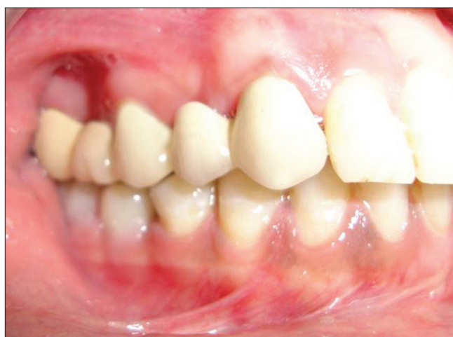
Figure 9: Postoperative intraoral buccal view