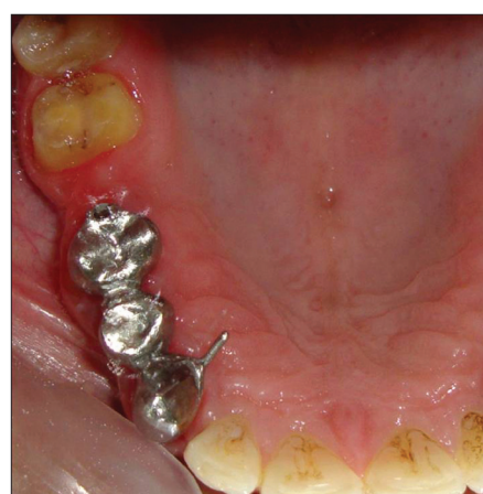
Figure 5: Metal try-in of the part with the matrix