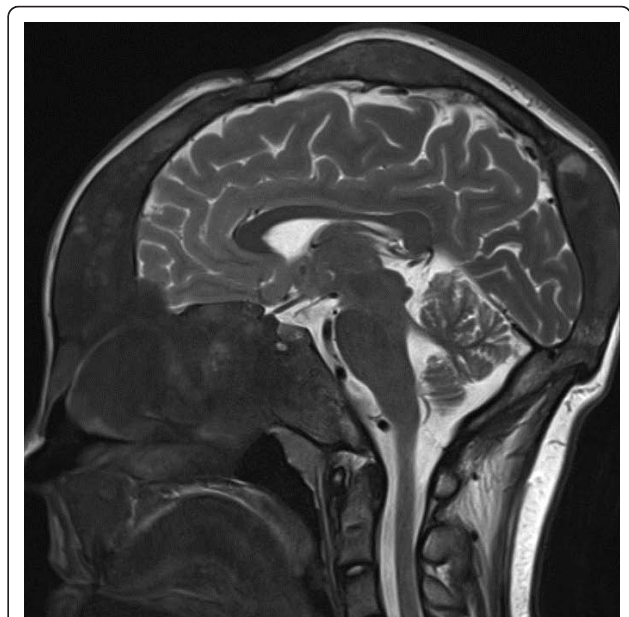
Figure 2 T2-weighted sagittal magnetic resonance image. Shows massive thickening of her skull base due to fibrous dysplasia and a pituitary adenoma.