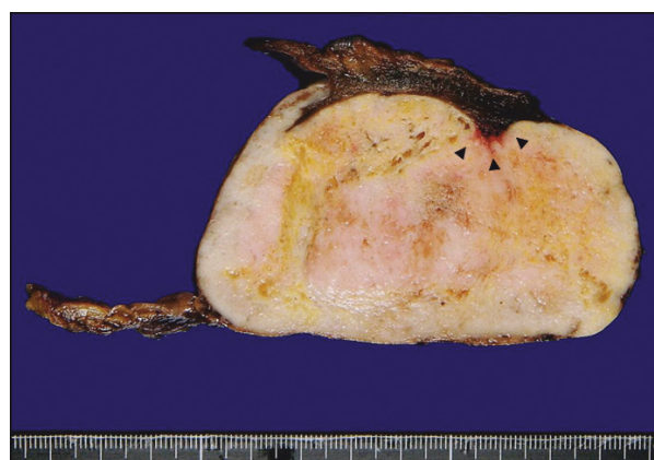
Figure 2 The oval-shaped tumor had a smooth surface, and its cut surface was homogeneously solid with a yellowish-white color. The tumor was partially involved in the lung parenchyma (arrowhead).

uneventful recovery and was discharged on postoperative day 6. An ectopic pulmonary site of origin, such as the mediastinum in this case, should be accepted only after the possibility of spread or metastasis from primary intracranial or intraspinal origin has been excluded. One month after operation, the patient had an enhanced magnetic resonance imaging (MRI) of the head and spine, and no abnormal findings were observed, which eliminated the possibility of an intracranial or intraspinal origin. He has been monitored for 12 months as an outpatient without any symptoms of recurrence or metastasis.