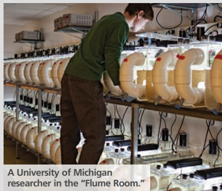
A University of Michigan researcher in the “Flume Room.”

The University of Michigan has created a specialized laboratory containing 150 artificial mini-streams, or “flumes,” that mimic a variety of river conditions as closely as possible. 1 The flumes are populated with rocks, sediment, biota, and more than 3,000 gallons of water from the Huron River. The goal is to better understand how different stressors—nutrient and chemical pollution, exotic species,