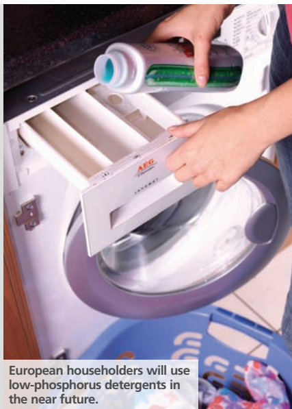
European householders will use low-phosphorus detergents in the near future.

In December 2011 the European Parliament approved new rules on phosphorus that will limit the amount to 0.5 g per single use of laundry detergent and 0.3 g per single use