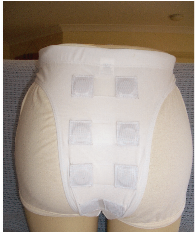
Figure 1. Photograph of magnetic pants, front and rear.

of female UI has included extracorporeal electromagnetic innervation (ExMI), for many years. In ExMI, a pulsed magnetic field is generated which induces an electrical depolarization of the nerves within the pelvic floor, consequently causing the pelvic floor muscles to contract. 11 It is postulated that ExMI passes uninterrupted through clothing and penetrates all body tissues without alteration. A series of small studies incorporating a variety of research designs undertaken in the USA, 11-12 Japan, 13-14 South Korea, 15 Australia, 16 and New Zealand 17 has established the acceptability of ExMI to patients. These early studies provided beginning evidence that this therapy was effective in reducing the number of incontinence and leakage episodes in women with both stress incontinence 11 and overactive bladder, 9,15 thus improving their quality of life. 9,17 In addition, continuous electromagnetic stimulation has been shown to affect urethral closure and bladder inhibition, 14 elevate urethral closure pressure, and increase bladder capacity 13 . However, later studies have only found a significant treatment effect in participants with poor pelvic floor tone at baseline, 19 while others have found very high rates of recurrence of the incontinence. 16,19-20