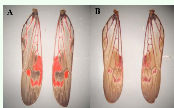
Figure 2. Comparison of wings from 1-day-old adult Homalodisca vitripennis (A) and 60-day-old adult H. vitripennis (B). High quality figures are available online

period of collection was between 26 May 2009 and 24 June 2009. This time period was used because this is when an "influx" of insects is known to occur consistently every year (Lauziere et al. 2008). The age of the insects were relevant because if they were young insects it would add weight to existing theories that F1 generation adults (F0 being the overwintering parents) have recently emerged and are actively searching suitable host plants. In two of the vineyards (labeled B and D), samples were collected approximately one month apart in order to compare the ages within the same vineyard. The wings of each H. vitripennis were removed and photographed as previously described.