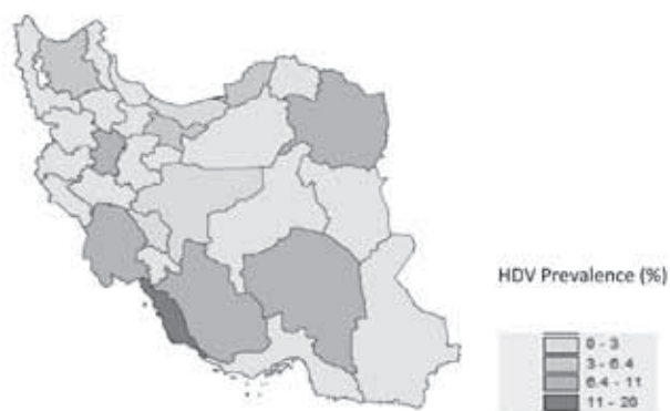
Figure 2. Regional Distribution of Pooled or Individual Prevalence of Hepatitis D Virus Infection Among HBsAg-Positive Patients in Iran, 1983-2008

detect this factor's impact on HDV prevalence. However, other factors, such as a greater possibility of multiple partners, intravenous drug abuse, war injury, and a higher rate of HBV infection in men (9), can be explained as possible causes of this divergence. The results of this study showed that the main routes of transmission for HDV are blood and blood products; therefore, individuals with a history of transfusion, surgery, tattooing, war injury, dentistry interventions, endoscopy, hemodialysis, intravenous drug use, and patients with coagulation factor disorder are at risk of HDV. This route of transmission is more similar to Western Europe and United States (55). The important groups in our review were hemodialysis patients and intravenous drug users. However, this association was not statistically significant, which may be due to the unadjusted ORs to other factors. We did not have enough data to assess interfamilial and sexually transmitted routes. In addition, the trend of the disease in HBeAg-positive patients with hepatitis D has not been well established. Previous articles showed HBeAg-positive rates of 15 to 30% among HDV patients (6). Our findings demonstrate that HDV is more common in patients who are HBeAg positive.