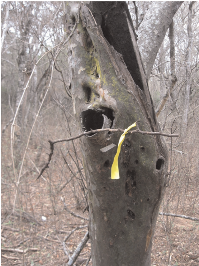
FIGURE 2. Hollow tree of the Bolivian Chaco, positive for Triatoma infestans . Typical ecotope in which sylvatic triatomines were collected in the current fieldwork.

hypothesis of an ornithophilic feeding behavior of these populations. Nevertheless, most of the hollow trees in which T. infestans were found during the current fieldwork did not seem to be inhabited by birds. Consequently, other blood sources (lowly infected small mammals, reptiles) and the