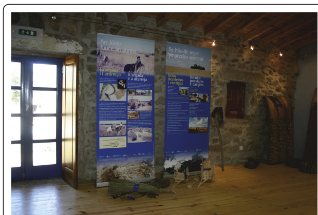
Figure 5 The Ecomuseum of Terra de Miranda as an example of successful local initiative.

The Ecomuseum approach seems to be an interesting way of dealing with local knowledge at different levels: