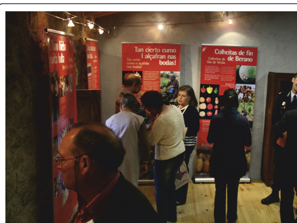
Figure 6 The Ecomuseum approach seems to be an interesting way of dealing with local knowledge at different levels: communities, authorities and visitors.

community, social and cultural, natural environment, institutional. The balance of one year of activities provide valuable insights into perceptions and concepts of local knowledge and of natural resources conservation and management within protected areas established long ago or more recently.