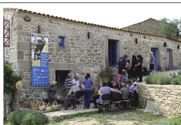
Figure 7 Local knowledge is an important tool for educational and promotional purposes within natural resources conservation, management and sustainable use.

Along the interviews, new farming practices, abandonment of farming and husbandry activities, a better mobility and a new concept of residential housing were some