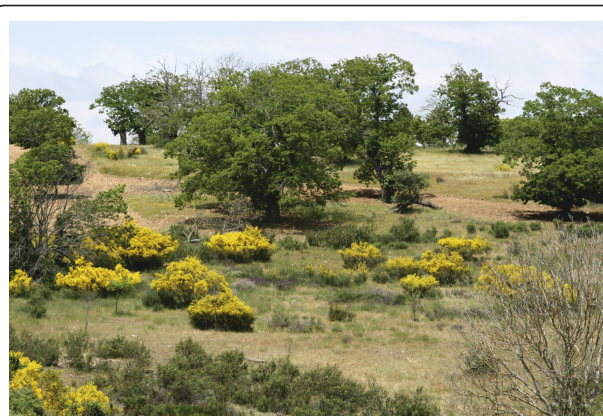
Figure 4 The signs of land abandonment: lands progressively exhibit a different floristic composition and scrubland is represented by a tallest stratum.

Therefore, the protected areas of Montesinho and Douro International are suffering a decline as a result of measures that do not promote innovative and participatory approaches based on LK, disclaim cultural heritage and do not provide a recognized/valued lifestyle.