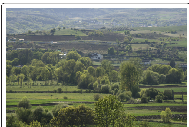
Figure 2 Traditional landscape of Trás-os-Montes: a mosaic composed of different patches finely linked to each other, mostly highlighted by the seasonal contrasts of natural vegetation and agricultural activities.

Therefore, traditional landscapes are mosaics composed of different patches finely linked to each other, mostly highlighted by the seasonal contrasts of natural vegetation (e.g. perennial or broadleaved forests, woodland and scrubland) and agricultural activities (e.g. fallows, manure, hay or grazed meadows, orchards, gardens). Such landscapes are perceived as images of LK which provide skills and tools to built such a mosaic while maintaining a balance between human activities and nature, and a source of motivation, as they are considered part of the cultural heritage and have embedded intangible values such as dwelling, spiritual and aesthetic values, local tradition, neighborly and inter-generational relations [17,21].