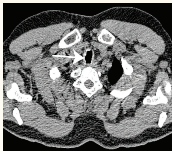
Figures 1b & 1c: Axial sections of the chest with arrows showing thickening and calcified lesions in the anterior wall of the trachea.