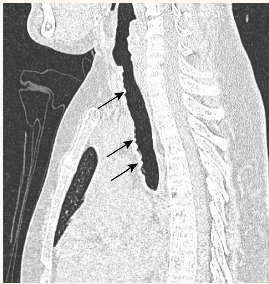
Figure 1: Sagittal section of trachea with arrows showing thickening and calcified lesions in the anterior wall of the trachea.

radiographer by profession and his family history was unremarkable.