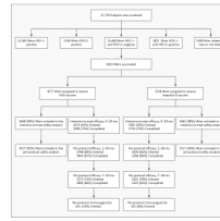
Figure 1. Randomization of Study Subjects