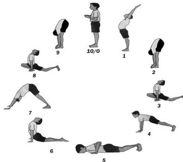
Fig. 1: Steps involved in sun salutation. 0/10: Stithi/ Pranamasana , 1: Hasta Uttanasana 2 and 9: Padhastasan , 3 and 8: Dakashinpad Prasarnasan , 4: Dwipad Prasarnasan , 5: Saashtang Namasakarasan , 6: Bhujangasan , 7: Parvatasan

The experimental design was sequential self-control study which was conducted between January 2009 and September 2009. Eighty eight medical undergraduate students voluntarily enrolled in the present study. Those having a history of active sports training, yoga