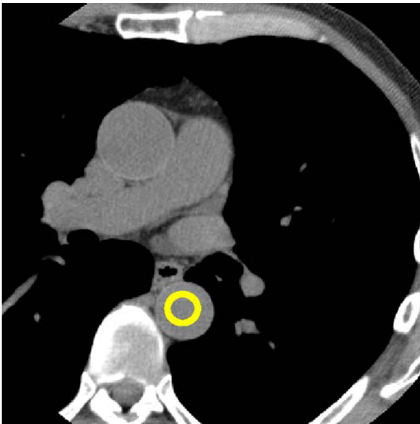
Fig. 2. Single axial scan at the level of the start position single axial CT image at the level of the start position of the helical scan with a region of interest in the descending aorta. HUs were measured in this region, and the helical CT data acquisition was started when the densities were consistently above 180