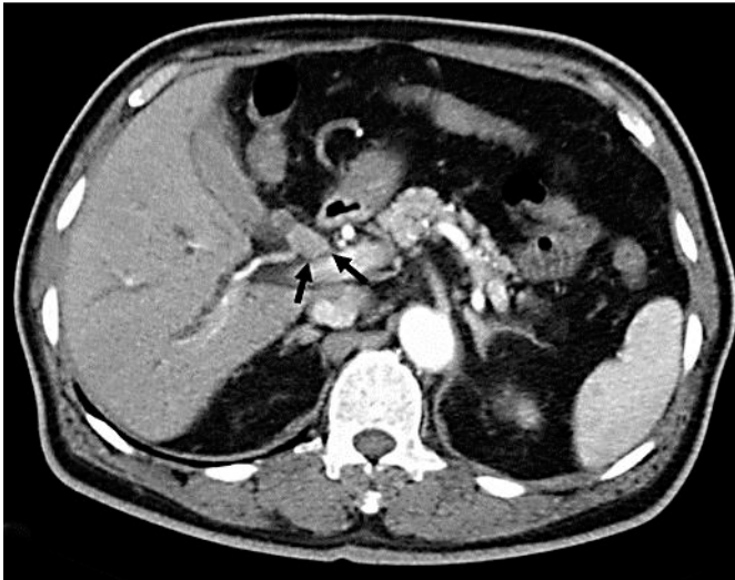
Fig. 1. Computed tomography revealed an enhanced mass at the proximal bile duct. Arrows indicate the mass lesion.