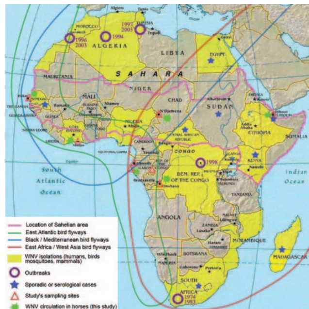
Figure 1. West Nile virus (WNV) circulation in Africa (3,6–10). Map of Africa summarizes published data related to WNV isolations, outbreaks, and sporadic or serological cases (including this study). It also indicates the main bird migration routes.

Blood was centrifuged within 24 hours after collection. Serum was separated, frozen at -20^{\circ}\text{C} , and sent to the virology laboratory of the Institut de Médecine Tropicale du Service de Santé des Armées in Marseille, France. Each sample was systematically tested for WNV-specific immunoglobulin G (IgG) by using an ELISA made in house. Antigen was prepared from a crude supernatant of Vero cells collected after 4 days of infection with WNV reference strain Eg 101 (viral titer >10^7 ID/mL) and treated with 1% Triton 100 and \beta -propiolactone (1:1,000). IgG was detected by using commercial peroxidase anti-horse IgG and tetramethylbenzidine as the substrate and standard procedures of ELISA capture. Serum specimens were considered positive for IgG when the optical density (OD) in