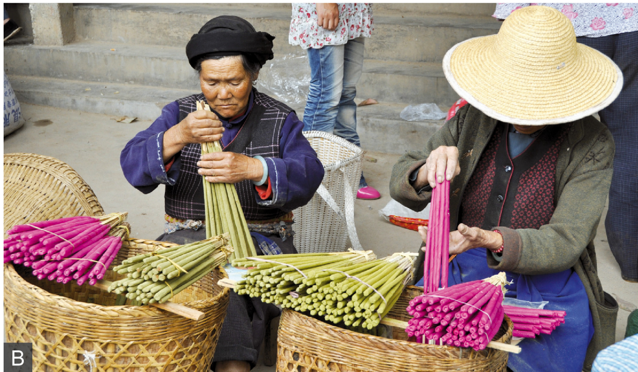
Figure 5 Joss stick production and trade. A, The materials for the production of red joss sticks comprise dry shoot axis (I), red cotton paper (II), wheat flour glue (III), sticky tubers (IV), dry Pinus yunnanensis root (V), and incense powder (VI; by Staub 2010). B, Joss-stick sale at the local weekly market in Sideng (by Ehrler 2010).