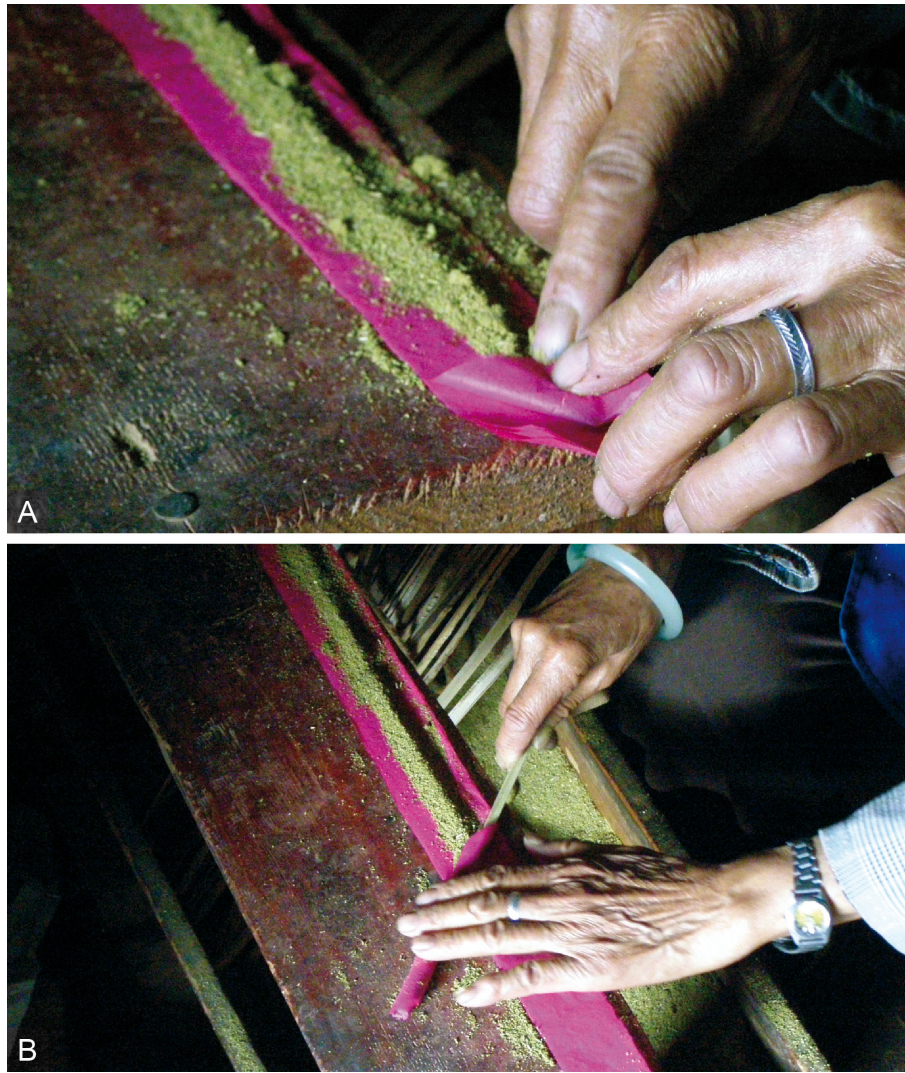
Figure 4 Local production of red joss sticks. A, B, For red joss-stick production, cotton paper is folded over a stick, and wrapped around it.

placed in a special holder fastened to one side of the gate so as to prevent bad influences from entering the house and the courtyard. Incense is also burned on a small altar close to the stove in the kitchen of a house where Zaojun (Kitchen God), can be worshiped. It was mentioned that the same altar is also a place for ancestors to meet the household members and to enjoy a meal. Incense is thus burned to invite the ancestors into the home.