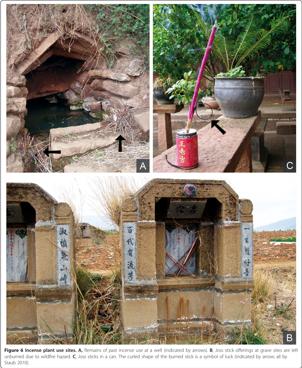
Figure 6 Incense plant use sites. A , Remains of past incense use at a well (indicated by arrows). B , Joss stick offerings at grave sites are left unburned due to wildfire hazard. C , Joss sticks in a can. The curled shape of the burned stick is a symbol of luck (indicated by arrow; all by Staub 2010).