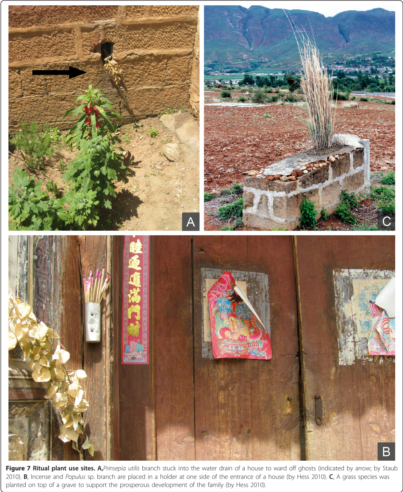
Figure 7 Ritual plant use sites. A , Prinsepia utilis branch stuck into the water drain of a house to ward off ghosts (indicated by arrow; by Staub 2010). B , Incense and Populus sp. branch are placed in a holder at one side of the entrance of a house (by Hess 2010). C , A grass species was planted on top of a grave to support the prosperous development of the family (by Hess 2010).