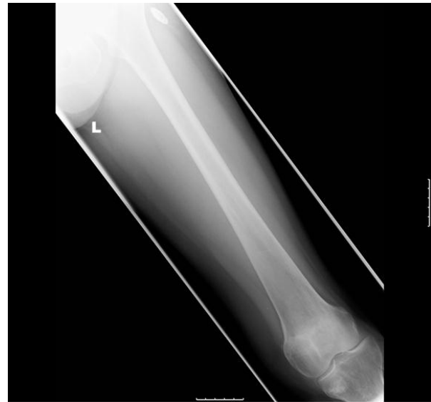
Figure 4 Anteroposterior radiographs of the left femur six months after diagnosis with resolution of symptoms and healed fractures.

Long-term bisphosphonate therapy has recently been associated with atypical proximal metaphyseal and diaphyseal femoral insufficiency fractures in a number of case series and reports [1-4,6,7,12-14]. Large randomized trials, however, have not shown a significant