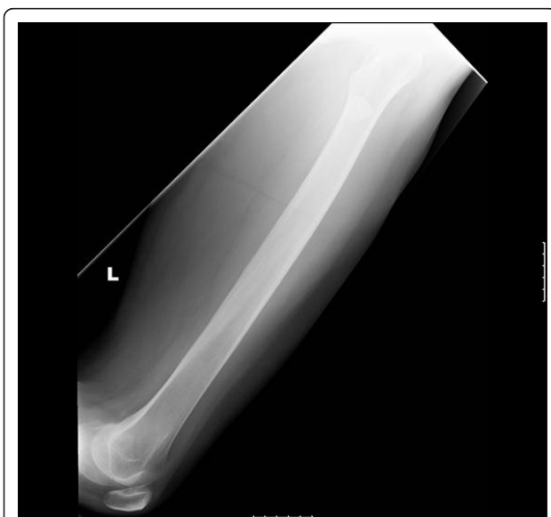
Figure 7 Anteroposterior radiographs of the left distal femur six months after diagnosis with resolution of symptoms.

The long-term oral corticosteroids and proton pump inhibitors which our patient was taking have been recognized as possible causes for increased fracture risk [4,14,17]. An increased risk of both vertebral and non-vertebral fractures has been reported with dosages of