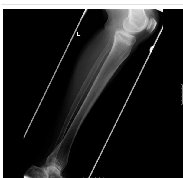
Figure 5 Lateral radiograph of the left tibia six months after diagnosis with resolution of symptoms and healed fractures.