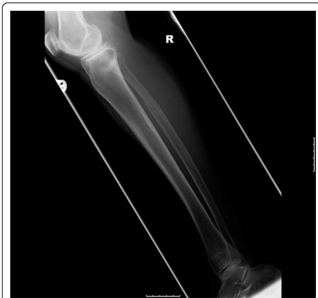
Figure 6 Lateral radiograph of the right tibia six months after diagnosis with resolution of symptoms and healed fractures.

[15], whilst the other patient was taking calcium and vitamin D supplements [16]. All the patients were fully active prior to injury and the fractures were associated with minimal trauma.