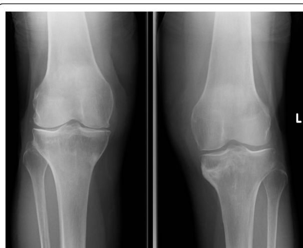
Figure 1 Anteroposterior radiographs seven months after the initial symptoms, showing osteosclerotic change with a periosteal reaction at both medial proximal tibiae.

Our patient was referred to the orthopedic department where she stated her bilateral knee pains had now significantly improved. On examination, she was found to have a normal gait, mildly swollen knees bilaterally with tenderness over her left proximal medial tibia and a good equal range of knee, hip and ankle movement.