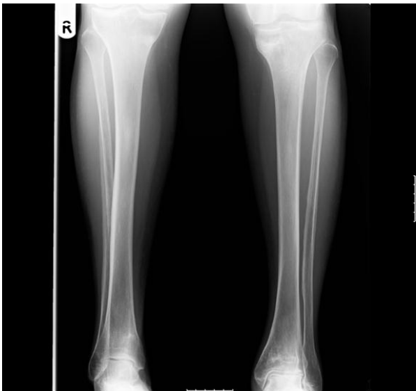
Figure 3 Anteroposterior radiographs of both tibiae six months after diagnosis with resolution of symptoms and healed fractures.

increased risk or a causal relationship [12]. This case highlights what we believe are atypical bilateral tibial and unilateral femoral insufficiency fractures occurring in a patient on long-term bisphosphonate therapy. Previous reports of atypical tibial insufficiency fractures are few in number [15,16] and describe fractures of the tibial diaphysis as opposed to the proximal metaphyseal fractures seen in this case. Similarities of note between the cases are that one patient had rheumatoid arthritis