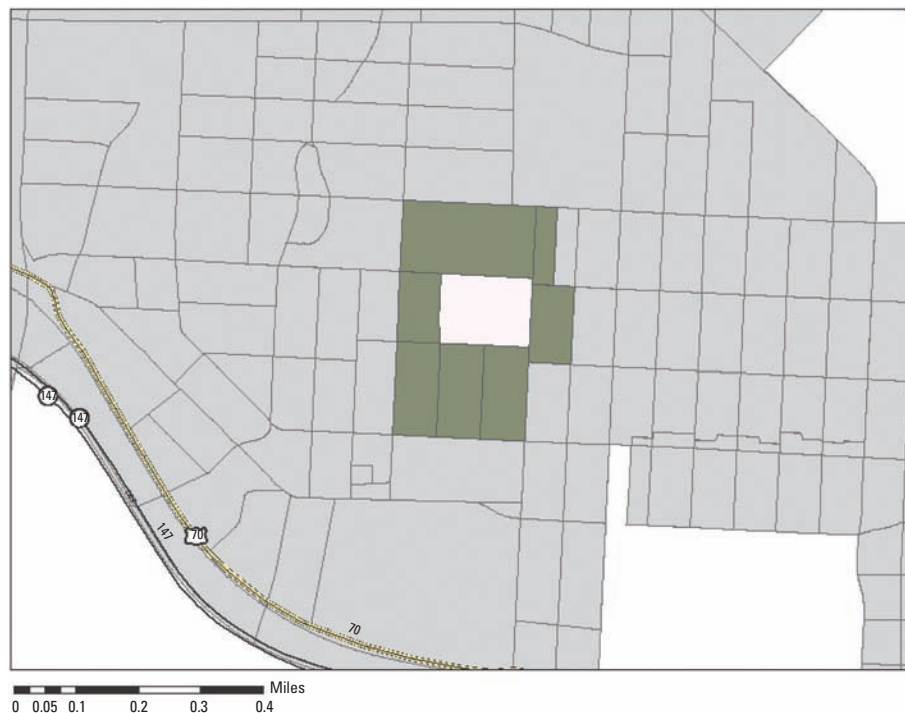
Figure 2. Illustration of PAC designation, City of Durham, North Carolina (USA).