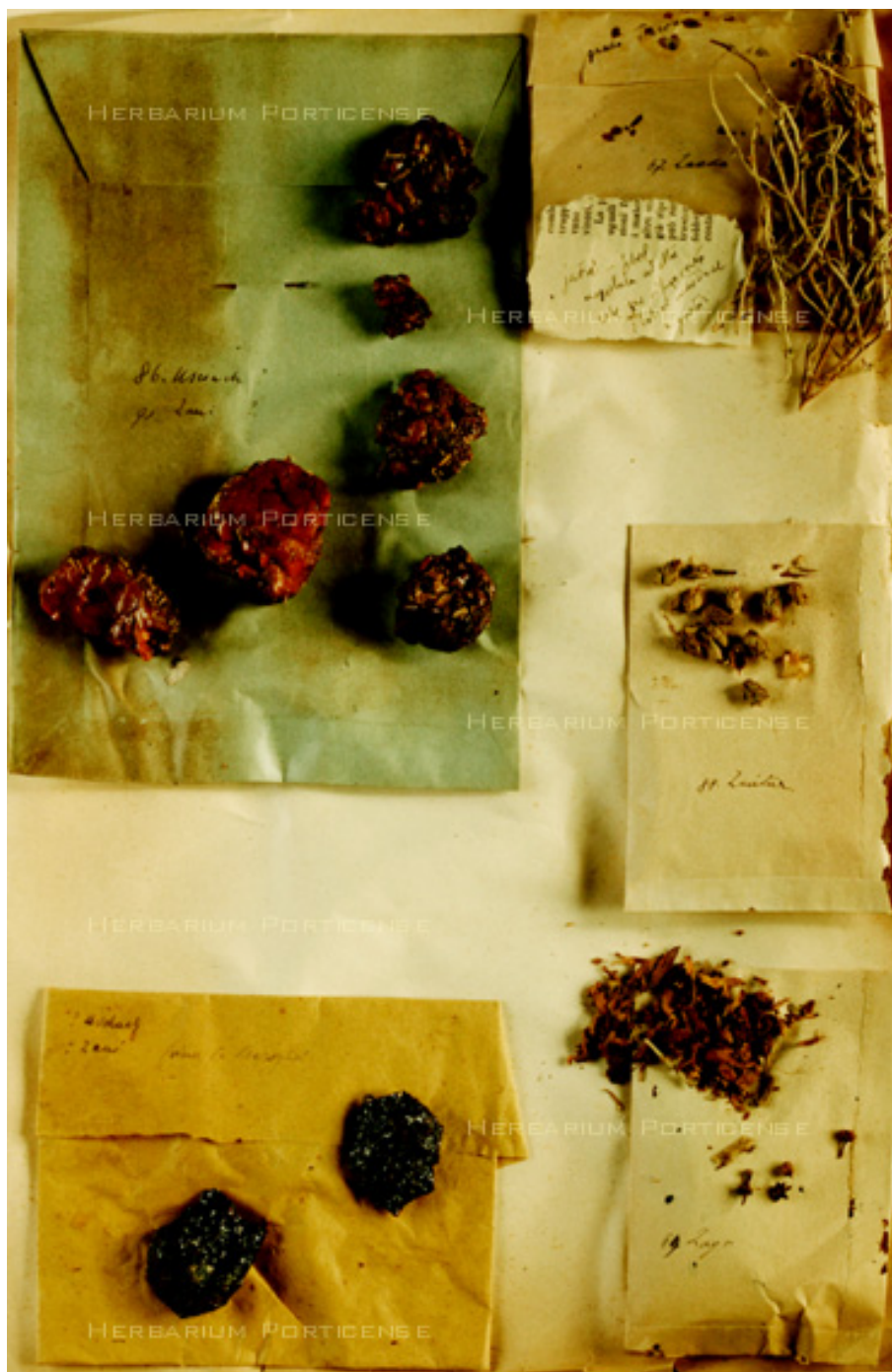
Figure 5 Paper sheets and boxes containing the drugs.

Overall, 75 plants (including the four lichens previously mentioned) were also collected as drugs by Trotter; 30 of these had medicinal properties. Two mineral samples (antimony and clay) were also held in the drug collection (Figure 7 and 8); they were used in topical wound treatment by numerous ancient and primitive societies [51]. The drugs were mainly sold in the Tripoli