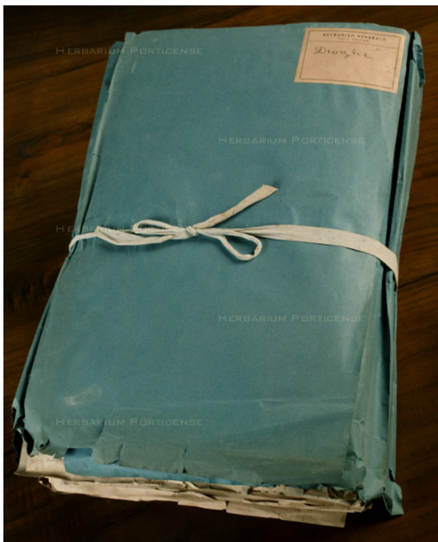
Figure 4 A drug package.

plants in Mediterranean area [46]. The authors suggest that this could be because the plants belonging to these families are easily recognizable by the morphology of the flowers and due to their aromas and flavors.