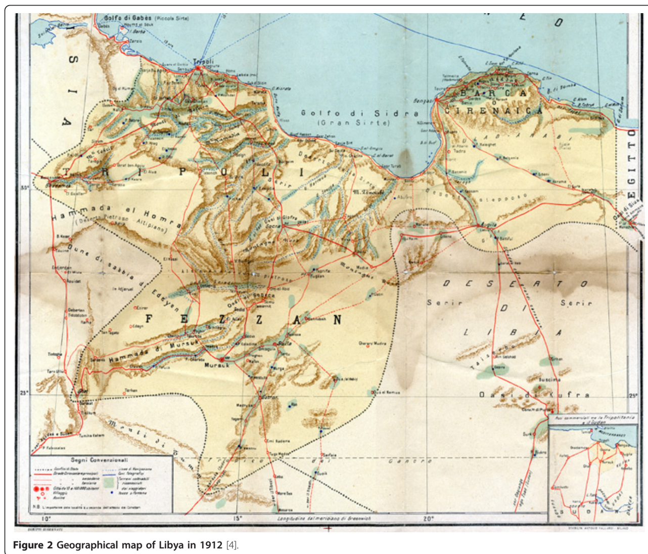
Figure 2 Geographical map of Libya in 1912 [4].

by Trotter in 83 paper sheets or boxes (Figure 5), which were stored in a wooden cupboard (Figure 6). Included in the collection were some unidentified drugs, corresponding to n. 74 and 83.