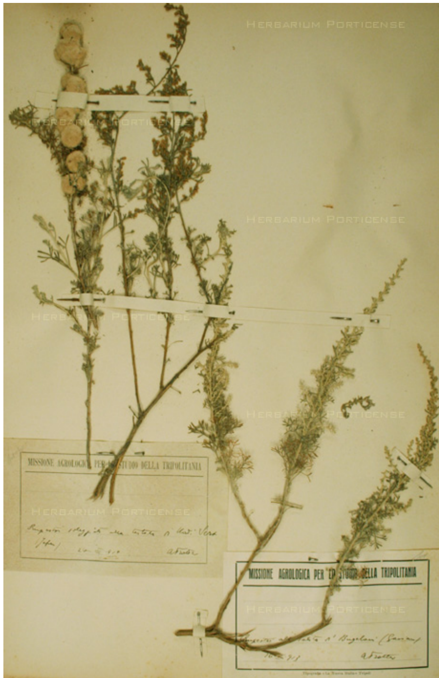
Figure 3 Herbarium specimen from Trotter collection, Artemisia herba-alba Asso.

only that the plant was used as a medicine, without describing the therapeutic applications. Notwithstanding these limitations, a not-irrelevant body of knowledge was assembled.