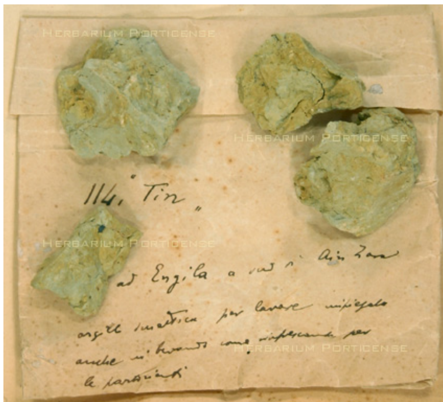
Figure 8 Clay (PORUN - TTD77), Tripolitania Trotter collection Drug section.