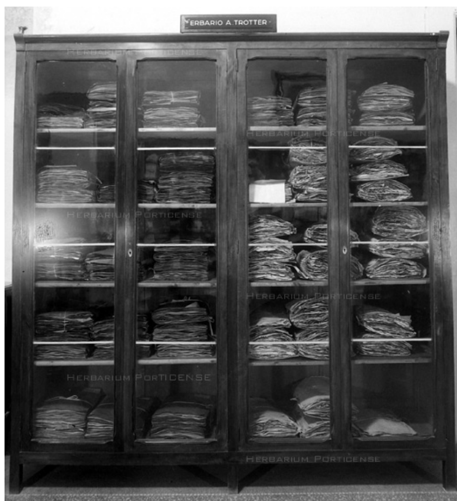
Figure 6 The original wooden cabinet of Trotter Herbarium.

essential commodities of the Mediterranean region in classical era [52]. A late echo of the ancient flourishing trades was still present in the drugs found by Trotter at the beginning of the 20th century. He collected drugs that are, to a large extent, of Mediterranean origin, and are currently traded in Mediterranean region. Drugs from herbs such as Ajuga iva or Artemisia arborescens or those belonging to the genera of Lamiaceae, listed in Table 1, are commonly found in the markets along the Mediterranean, from Moroccan bazaars [44] to the herbal shops of Turkey [40] and Greece [53]. In contrast, some drugs were of Asiatic provenance, such as Alpinia officinarum [54] and Piper retrofractum [55], whereas others, such as Tanacetum parthenium , came mainly from Europe [56], suggesting that the ancient trade routes from Asia and Europe to North Africa were still being used a century ago. Few drugs were produced from indigenous plants; perhaps the most interesting case is that of Ferula marmarica , a plant native to some