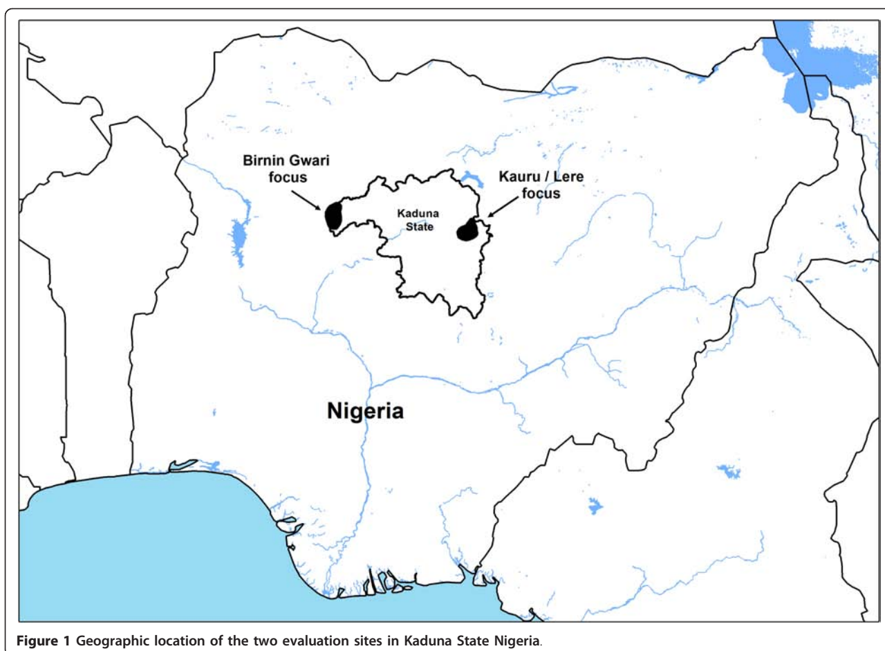
Figure 1 Geographic location of the two evaluation sites in Kaduna State Nigeria.

are located along the rivers of Mairiga and Kwingi in Birnin Gwari and Galma and Karami in Kauru and Lere. The two foci were selected for the following reasons: i) communities in these foci had pre-control epidemiological data; among the areas where large-scale ivermectin treatment was first introduced in Africa were these two foci in Kaduna in which treatment of a sample of the population started as part of a randomised controlled trial of ivermectin in 1988 and 1989, and where skin-snip surveys had been done in preparation for the trial [6,17]. ii) the foci included hyper-endemic villages, i.e. villages with a prevalence of microfilaridermia > 60% [15-17]; iii) the area was located along a river with known breeding sites of Simulium damnosum s.l. , iv) the communities had had 15 - 17 years of annual treatment with ivermectin using the community-based programme since 1991, and subsequently through the community-directed treatment with ivermectin (CDTI) strategy from 1997 with more than 65% treatment coverage.