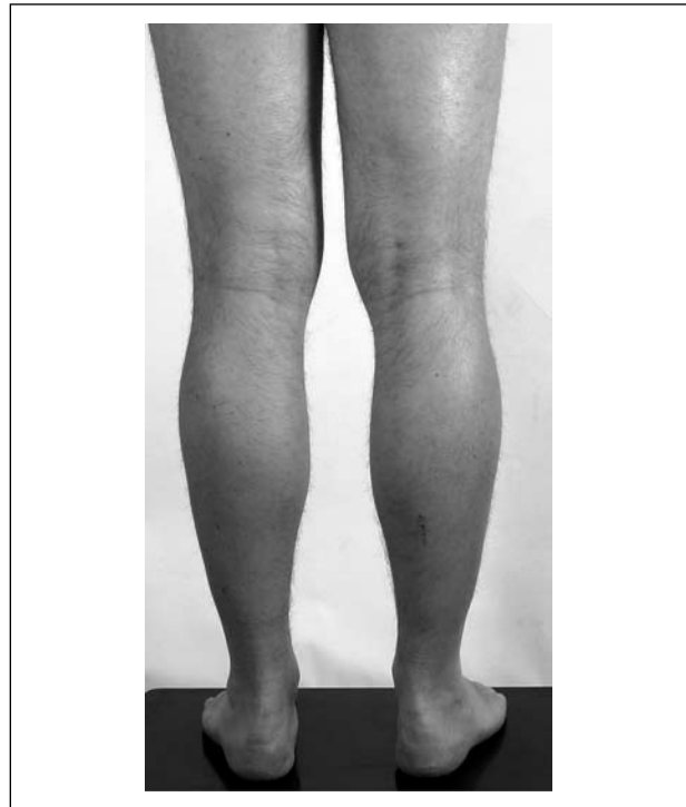
Figure 2. The maternal uncle of the proband showing slight hypertrophy of his calves.

notype. These mutations introduce premature stop codons (6-8) or disrupts correct reading, all leading to loss of functional dystrophin protein. Here we present the first report of patients hemizygous for a deletion in exon 26.